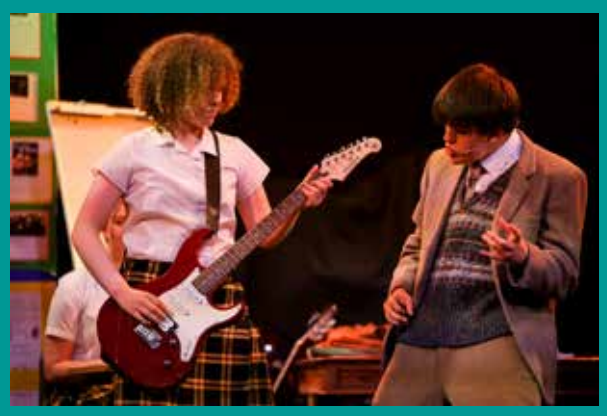
School of Rock