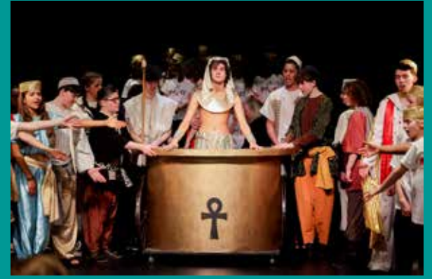
Joseph & The Amazing Technicolor Dreamcoat