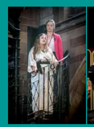
Dido and Aeneas