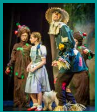
The Wizard of Oz