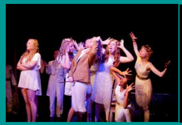
Orpheus in the Underworld