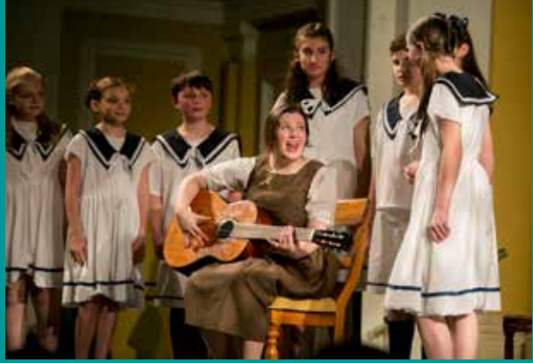
The Sound of Music